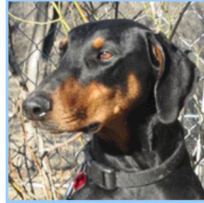
Angel Brodie Walker 2003–2011