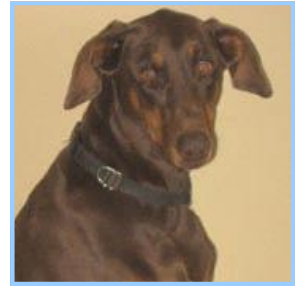
Angel Sadie Falcone 2000–2011